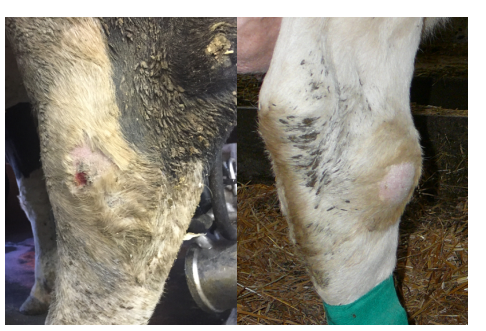
2 = Medium swelling (1 to 2.5 cm) and/or lesion or scab on bald area.