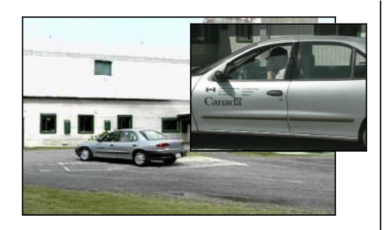
12. On arrival at the farm, always park the vehicle in a <u>clean</u> area with no obvious manure accumulation. Avoid exhaust fans from livestock areas. Close all windows to prevent insects from entering the car.