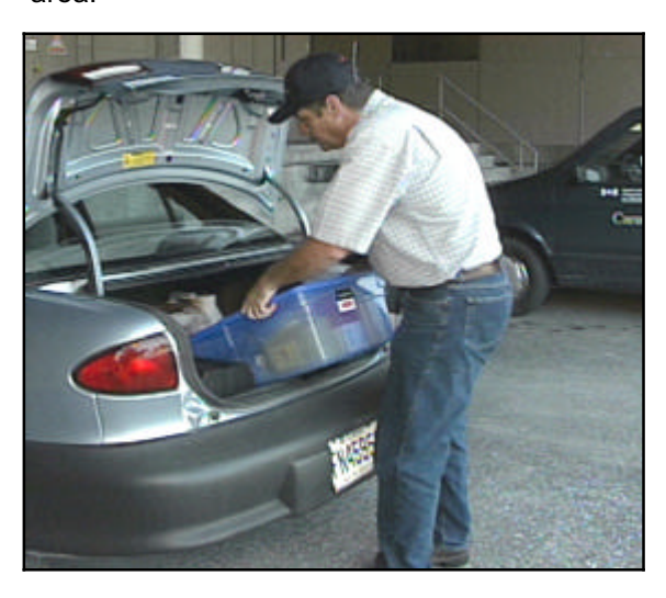
38. Remove test samples and the plastic carrier from the <u>dirty</u> area.