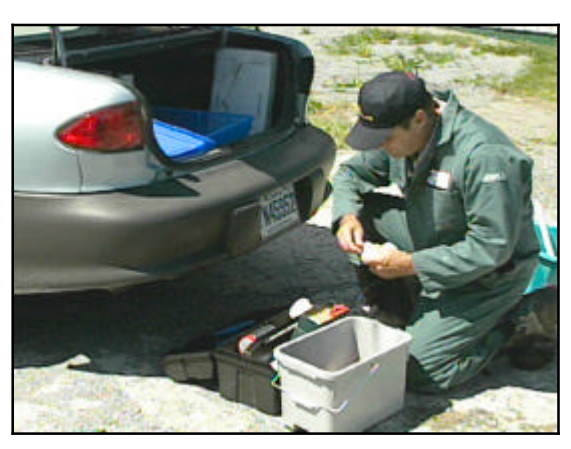
26. Wipe down equipment that has been soaking. Open equipment box and clean any extraneous material from taggers, blood samples, etc, used for livestock activities.