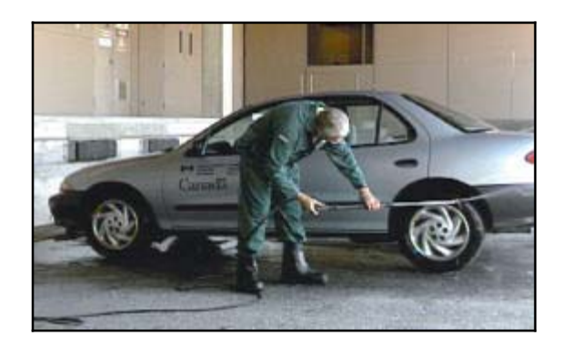
43. Commercial carwashes or a heated garage with powerwash capabilities should be used to facilitate clean-up in winter.