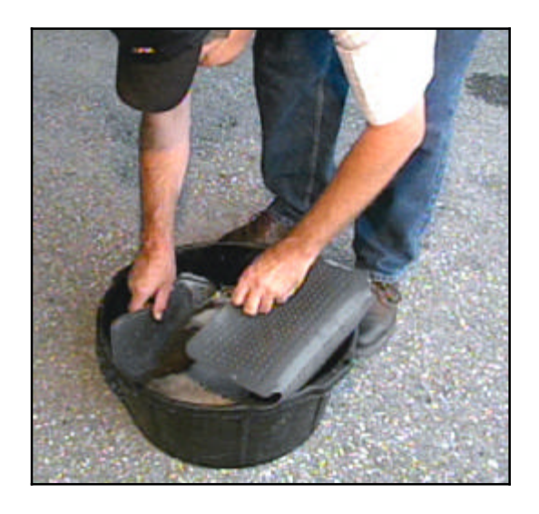
42. Clean and soak the floormats.