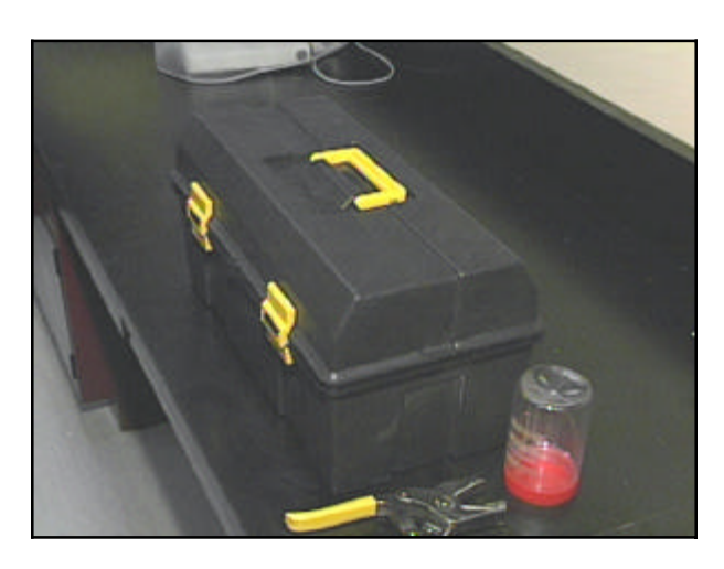
7. A tool box with an external plastic or non-permeable surface suitable for disinfection between premises can be used to hold testing equipment.