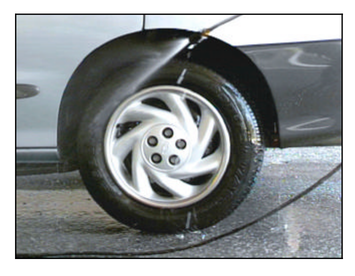
44. Pay special attention to tires and wheel wells.