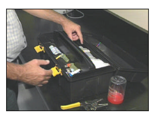
8. Small temporary "sharps" containers used on the premises should be disposable or readily disinfectable. To minimize the risk of contamination, only carry material necessary for one farm in the equipment boxt.