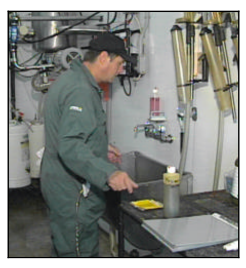
23. Do the preliminary cleaning of equipment and then prepare a disinfectant solution in the equipment pail. Equipment should soak for a few minutes.