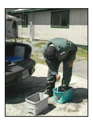
29. Brush and rinse your boots in the boot pail.