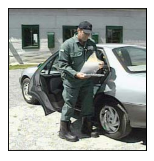
14. Take only the required number of forms to the livestock area.