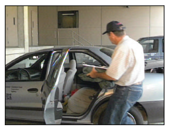
4. Clean coveralls and forms are kept in the <u>clean</u> compartment until used on a premises.