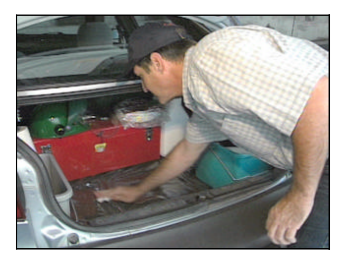
39. Complete cleanup of dirty area including equipment, carriers, and floor liner, etc., by vacuuming or brushing out organic matter. Disinfect so that the entire vehicle is <u>clean</u>.