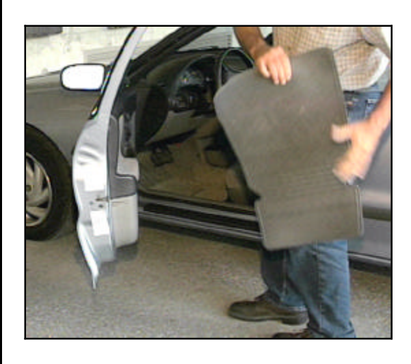
40. Shake out floormats from the driver and passenger areas.