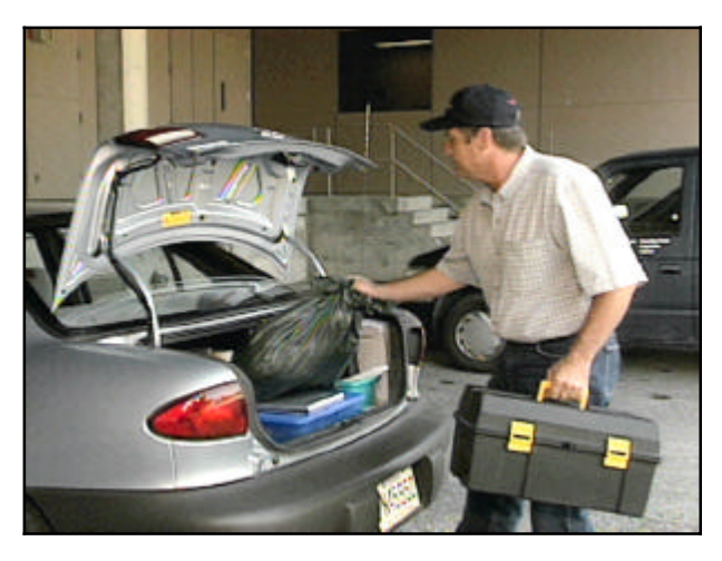
37. When you return to the office after last farm visit, remove equipment box and soiled clothing from <u>dirty</u> area.