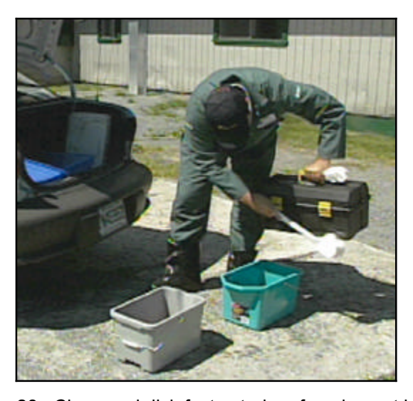
28. Clean and disinfect exterior of equipment box.