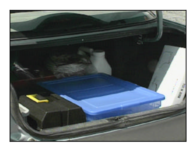
5. Clean supplies should be stored either in the clean compartment of the car or in a plastic carrier with a lid in the trunk of the vehicle.