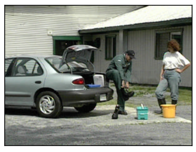
13. Put on clean coveralls and boots beside the vehicle.