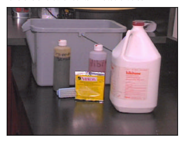
10. Disinfectants with a broad spectrum of activity should be used for boots and equipment (e.g. Virkon). Choose an approved skin disinfectant and handwash such as chlorexhidine (Hibitane). Iodine-based disinfectants with detergents are often used on the farm for cleaning. Bring equipment pail for cleaning and disinfection.