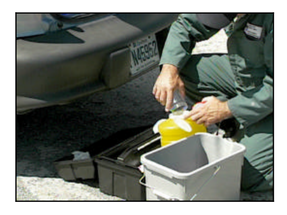
27. Empty small sharps container from equipment box to biohazard container in vehicle.