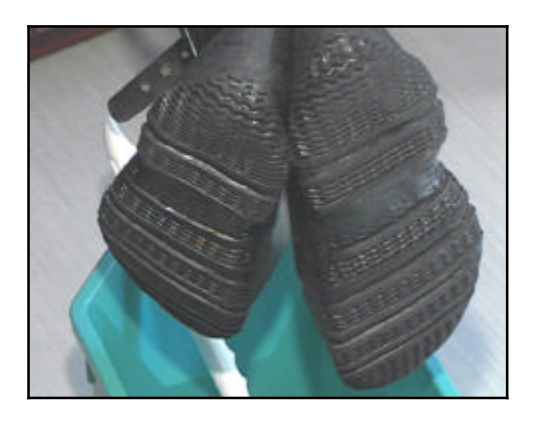
11. Rubber boots should have a pattern of the indentations on the soles that allows easy cleaning. Bring boot pail and brush.