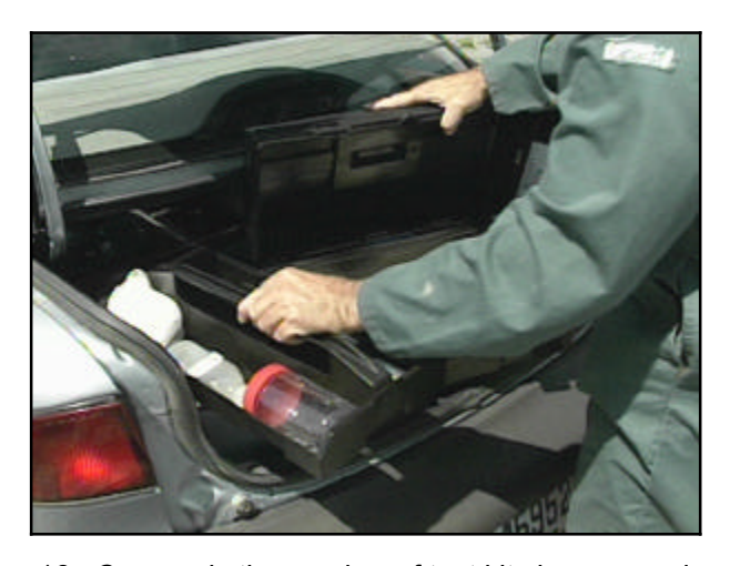
16. Carry only the number of test kits in your equipment box you will need to perform the required activities on the farm.