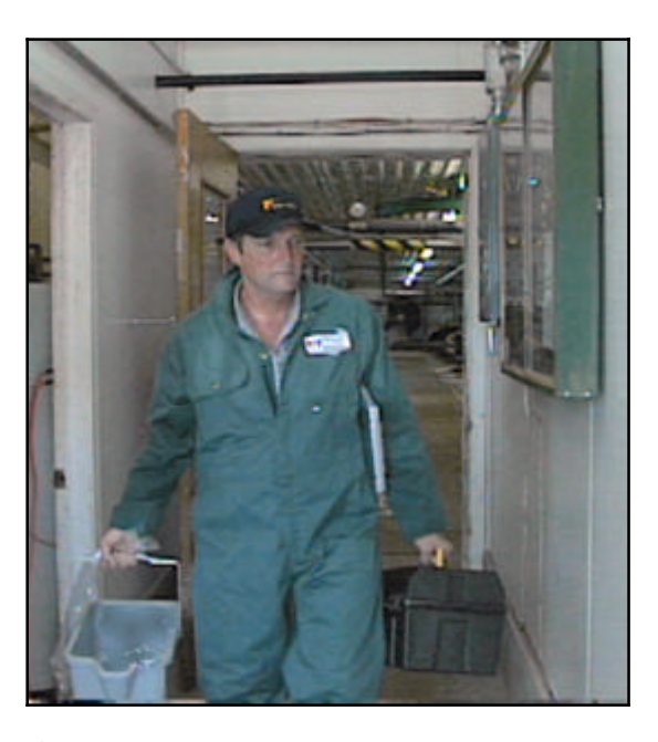
25. Return to the vehicle.