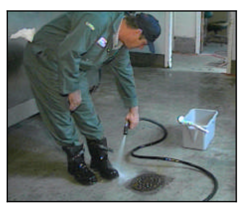
24. Pre-clean your boots if possible.