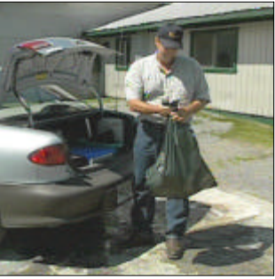
32. Remove (inside out) soiled coveralls without contaminating street clothing and place in <u>dirty</u> compartment, preferably in a heavy duty polyethylene bag or plastic carrier.