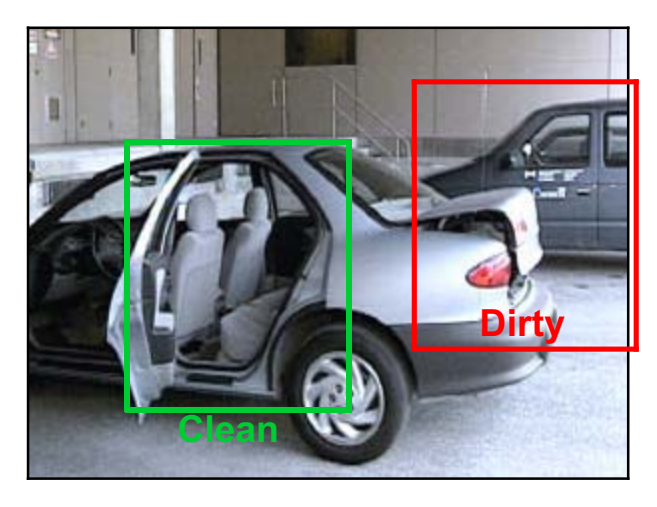
1. Vehicles must have a designated <u>clean</u> compartment such as the passenger area and a <u>dirty</u> compartment such as the trunk of the car.