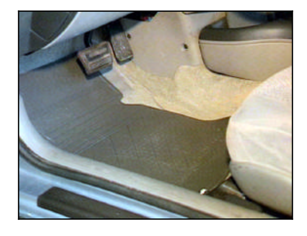
2. Rubber floormats should be used for the driver and each passenger.