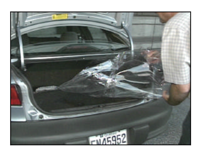
3. The entire floor area of the trunk should be covered with a single, solid rubber or heavy plastic liner that can be easily removed for cleaning and disinfection.