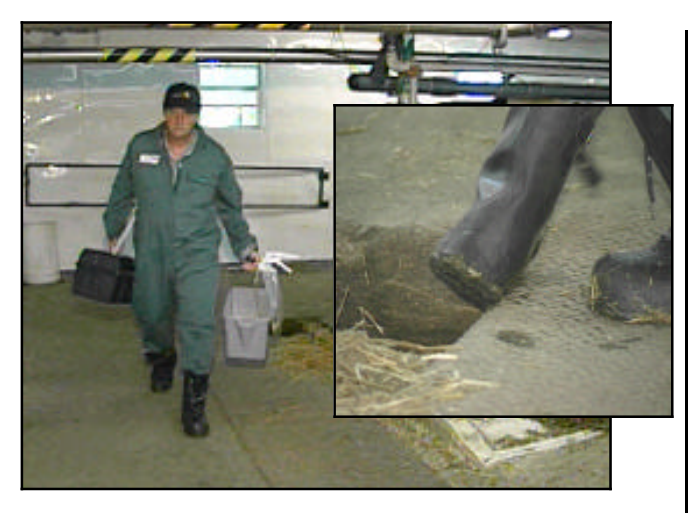
21. Before leaving the barn, remove manure and debris from your boots.