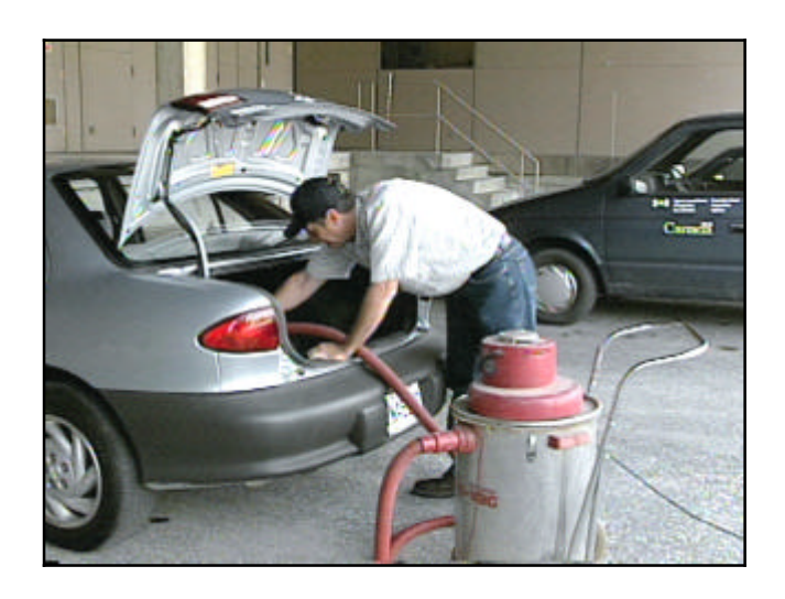
41. When necessary, do a more in-depth cleaning of the interior of the vehicle.