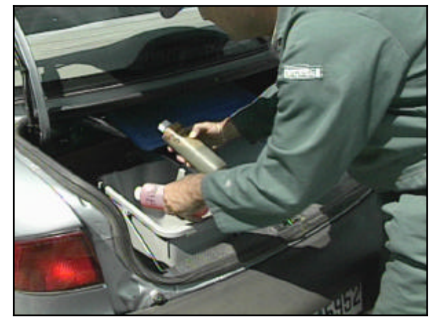
17. Take the equipment pail and cleaning solutions with you.