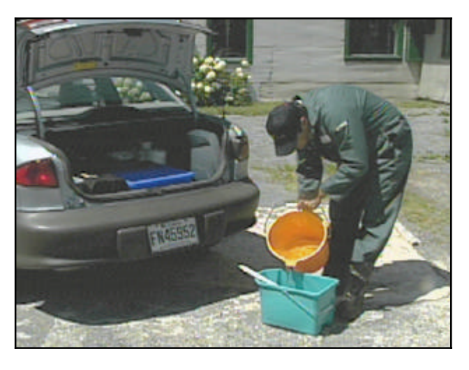
15. Prepare the approved disinfectant solution in the boot pail using the amounts of water indicated on the manufacturer's label.