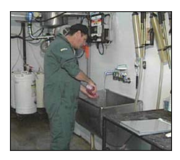
22. Wash your hands and the exposed portion of your arms with hand disinfectant and scrub under the nails. Wipe your hands with damp paper towel.