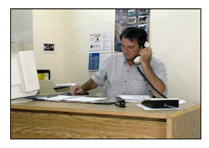
6. Inspections should be scheduled in advance with the farm owner/manager. Questions should be asked about the presence of diseases and any specific biosecurity requirements.