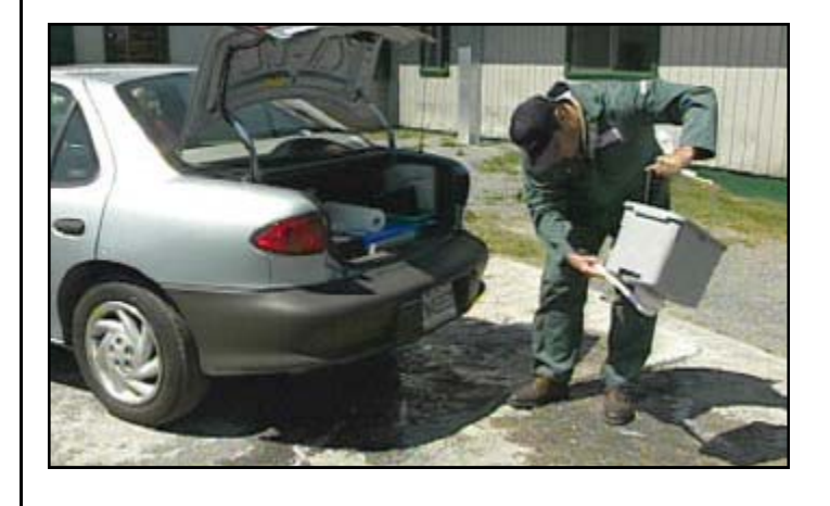
31. Using brush, wipe sides and bottom of equipment pail. Place in trunk and put C&D equipment back in equipment pail.