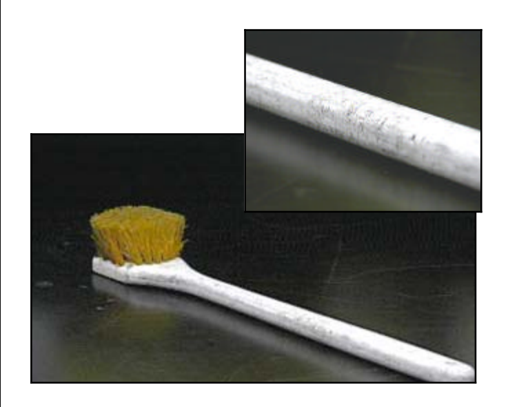
45. All plastic equipment, carriers, etc. should be replaced regularly to avoid deep scratches which cannot be readily cleaned and disinfected.