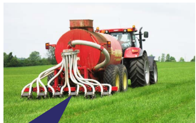
Example of a manure injection system:

Nitrogen leaching can result in indirect nitrous oxide emissions due to processes that take place in groundwater or surface water, which are linked to field practices.