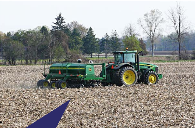
Example of a reduced tillage field:

Studies conducted in the Prairies reported lower nitrous oxide emissions from no-till plots compared to conventional tillage. No-till also reduces total GHG emissions from western Canadian croplands by increasing the storage of soil carbon.